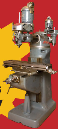
Bridgeport Serial #1