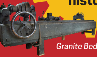
Granite Bed Lathe from 1825