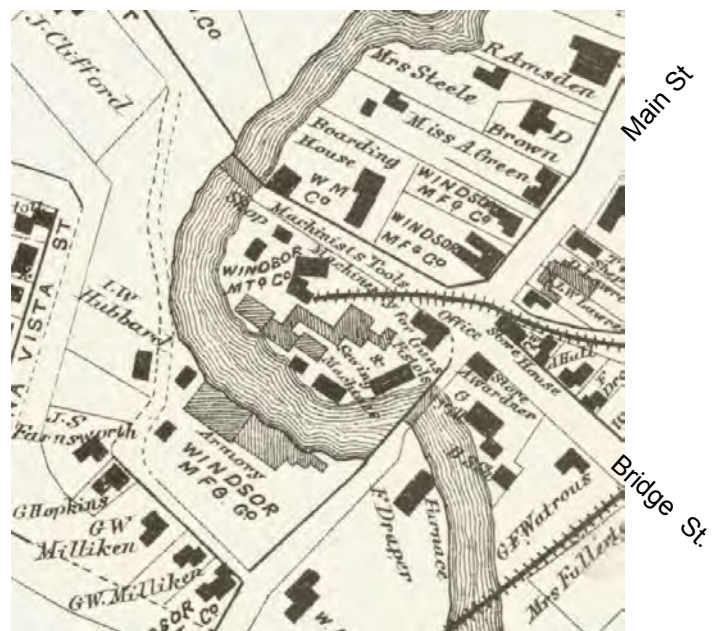
1869 Beers Atlas of Windsor County

Maps from the 19 th century show That this is where the workers would go To sleep and also get a meal... At a boarding house, that was the deal!