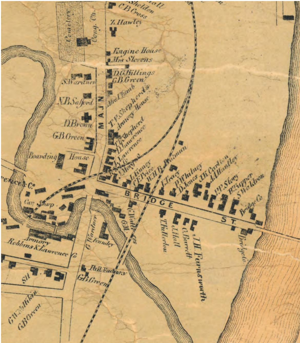
1855 Windsor County Map