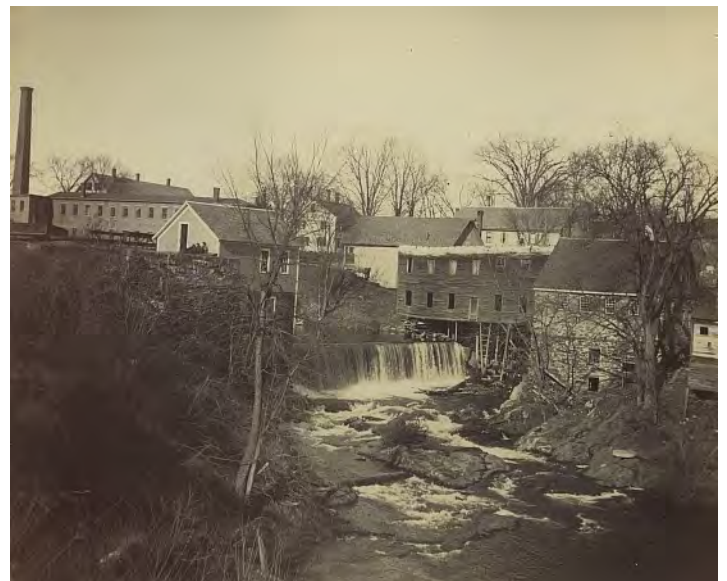
Photo taken looking upstream

Back up the hill, then left up the drive Cross the bridge—do not cross Route 5!