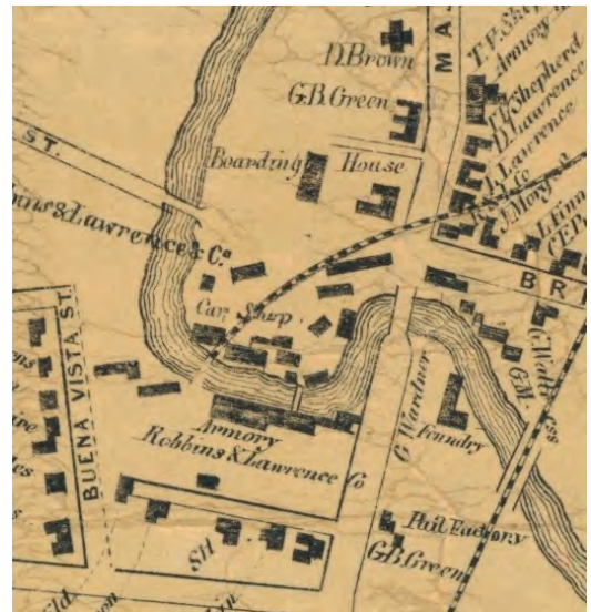
1855 Windsor County Map

This museum has many Windsor stories to tell Find them in the Museum beneath the bell.